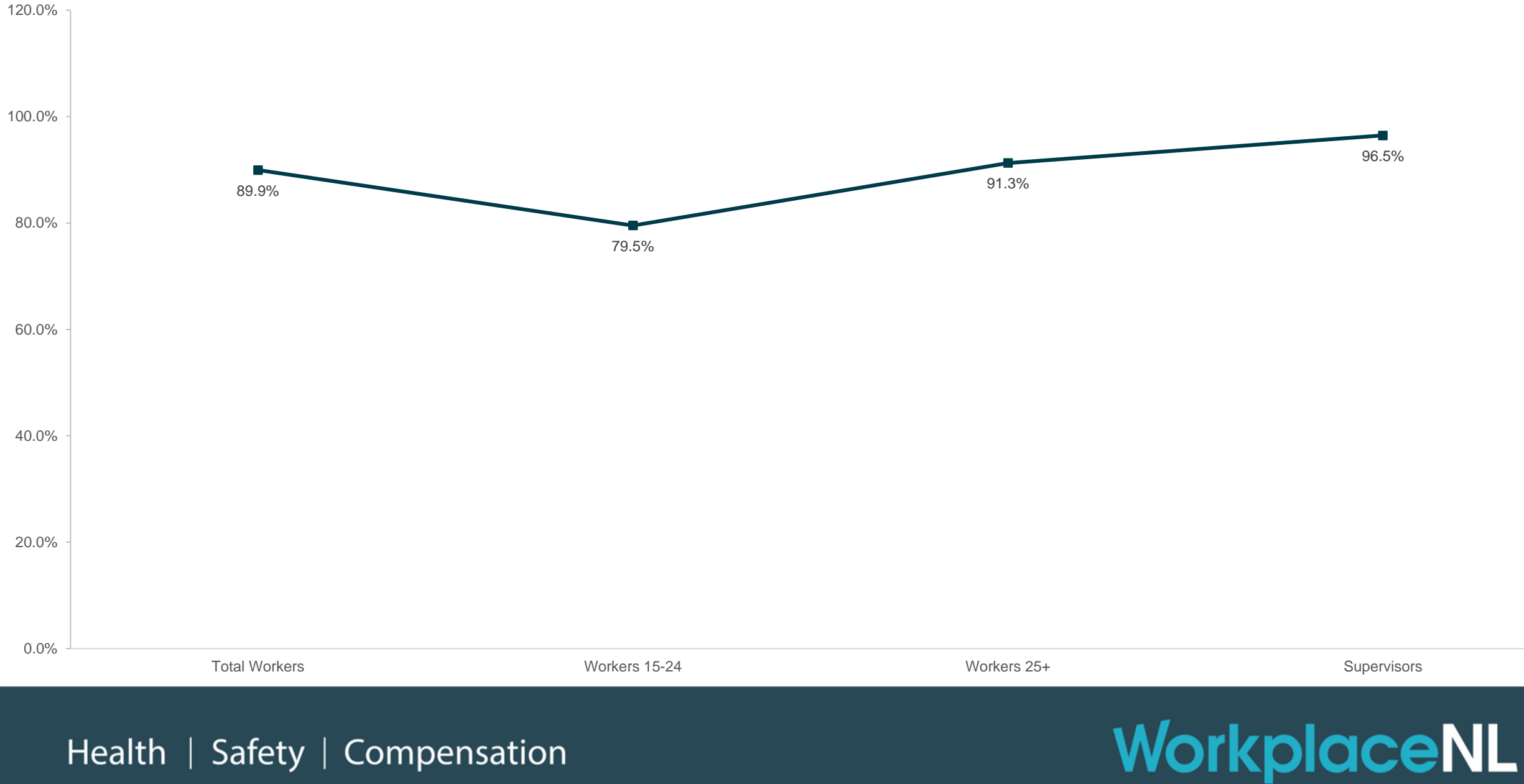
Health and Safety Awareness Survey Index By Group 2023